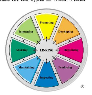
Types of Work Wheel

Working with teams all over the world, Margerison and McCann recognised that some teams were highly successful, whereas others, with similar experience, skills and abilities, failed. Problems such as conflict, mistrust and poor communication prevented some teams from reaching their full potential. Margerison and McCann's research examined the nature of work carried out in teams and identified eight core 'work functions' or different types of work, plus one central activity that integrated the work functions. These nine key success factors formed the basis for the Types of Work Wheel.